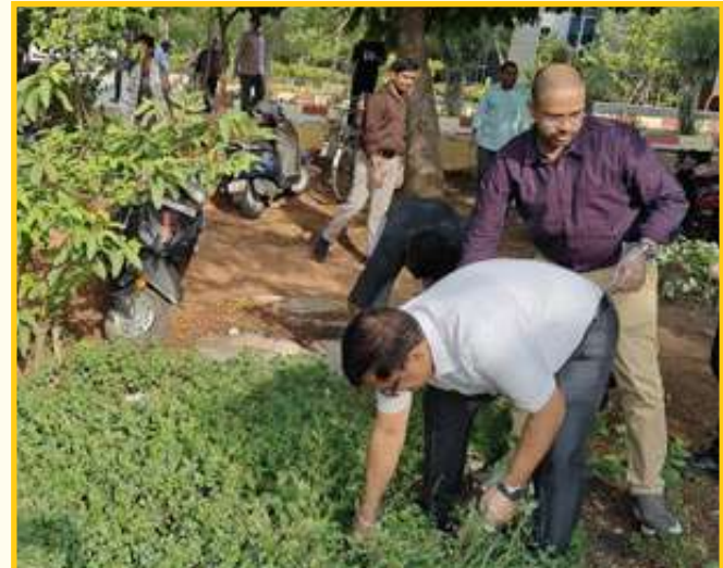
Glimpses of cleanliness drive conducted at Regional Office, Vijayawada, Andhra Pradesh