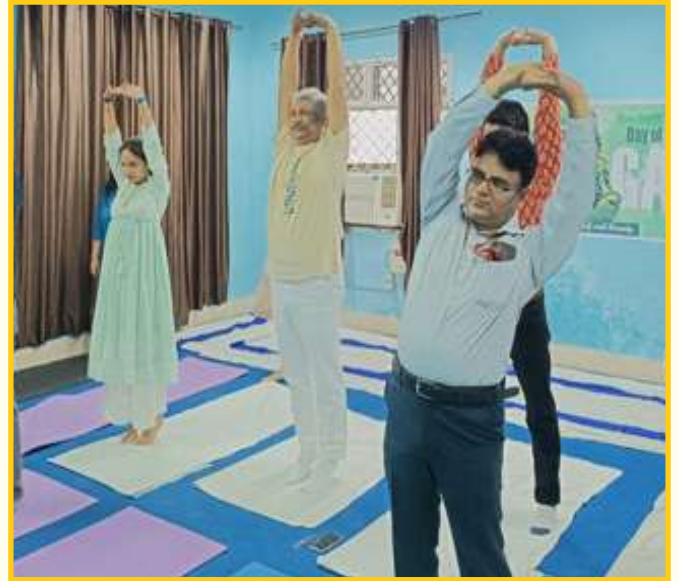
Insurance Commissioner Joined Yoga Celebration at ESIC Model Hospital in Jammu