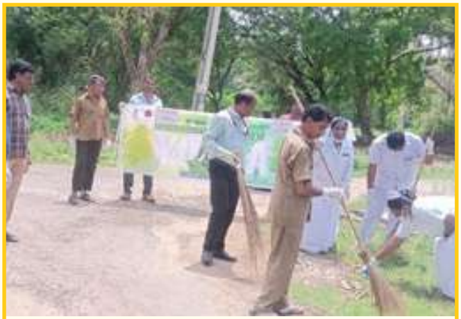
Cleanliness drives undertaken at ESIS Hospital, Peroorkada, Thiruvananthapuram, Kerala, and ESIS Hospital, Gunadala, Vijayawada, Andhra Pradesh