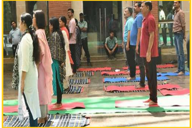
Yoga Camp organized at ESIC Hqrs.