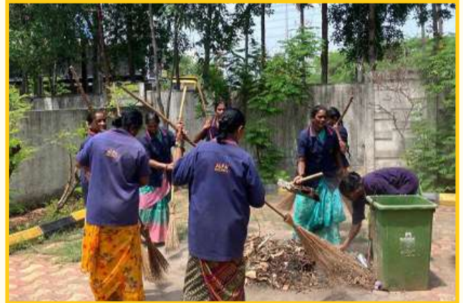
Cleanliness drive conducted at ESIS Hospital, Tirupathi, Andhra Pradesh