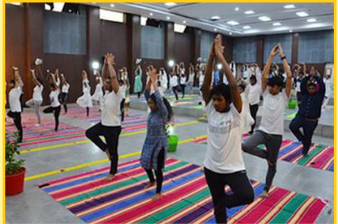
Director General, ESIC Leads Yoga Session at ESIC Medical College, Chennai on International Yoga Day