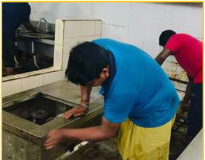
Special Cleanliness and tree plantation drive conducted at Sub Regional Office, Pune & Regional Office Bhubaneswar, Odisha