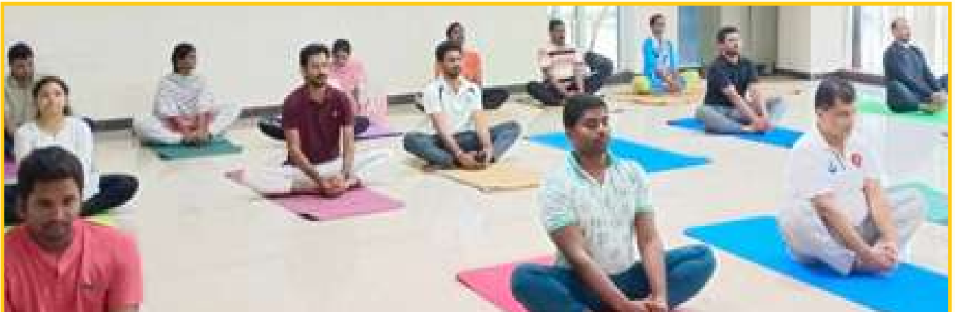
Regional Office, Vijayawada Celebrated International Day of Yoga 2024